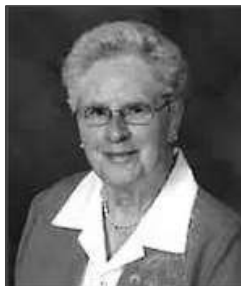
Lorna Wing 1928-2014